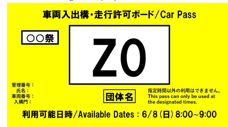
Sample Car Pass

IFF Staff will distribute Car Passes during GA#7 (6/2). Do not lose them.